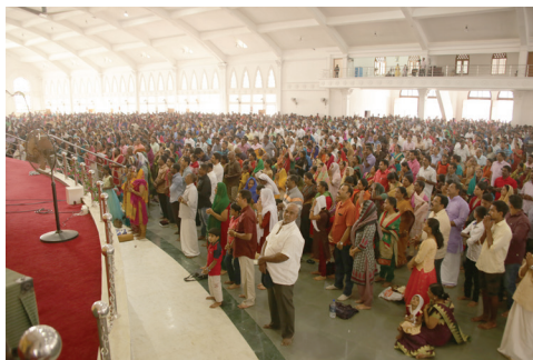
Vailankanni Basilica 2017

In December/January, a team will travel to India to spread the message of the Divine Mercy. To day, over the past sixteen years they have visited India some 23 times and spoken in over 100 Dioceses, to over 3 million souls in Parishes, schools, institutions, and retreat centres. Please keep the mission in your prayers in this preparation phase and especially during January, that God's merciful love will really touch the hearts and souls of all who hear this wonderful Mercy message.